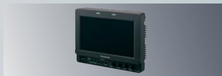
BT-LH80WU 7.9" Wide HD/SD LCD monitor