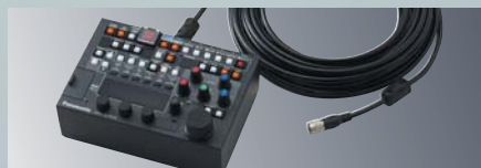
AJ-RC10G RCU (Remote Control Unit) with 32' (10 meters) remote control cable AJ-C10050G Remote Control Cable (164'/50 meters) * Not available in some areas. * Only functions that are supported by the camera can be controlled by the AJ-RC10G.